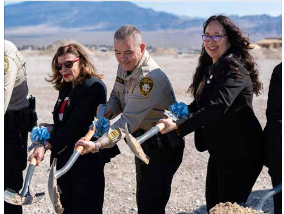
The new Igor Soldo Park, under construction at Iron Mountain Road and Alpine Ridge Way, will feature a splash pad, playground, soccer fields and pickleball courts.