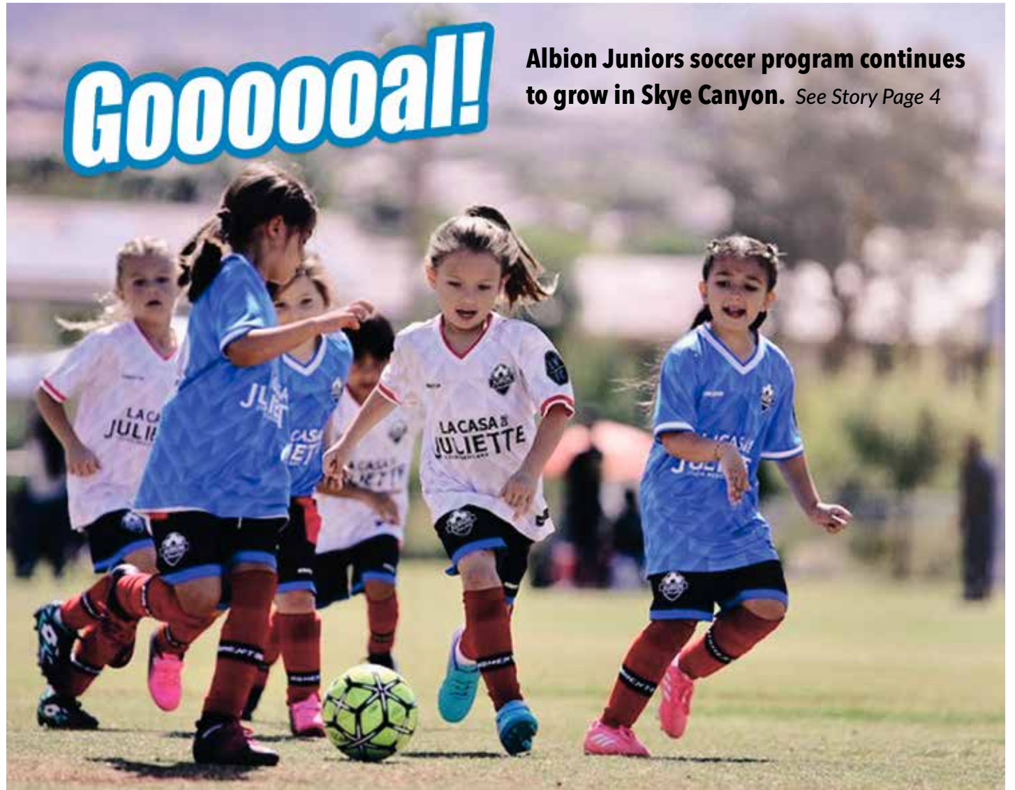
Albion Juniors soccer program continues to grow in Skye Canyon. See Story Page 4

SSWSS PERMIT NO. 707 LAS VEGAS, NV PAID U.S. POSTAGE PRSR STD