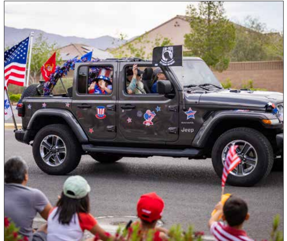
The forecast is red, white and blue for the May 23 Skye Canyon Patriotic Car Parade.

Termite Inspections . Pigeons . Scorpions . Cockroaches . Ants . Crickets . Bed Bugs . Silverfish . Rats & Mice